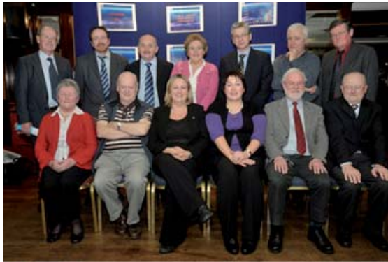
Board of Directors / Supervisors & Manager

The Credit Union Act 1997 requires the appointment of a Supervisory Committee which will oversee Directors in the performance of their functions, examine books and documents of the credit union and verify a sample of members' balances.